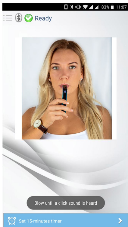
Photo taking during the test